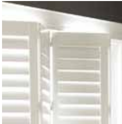
Bi-Pass and Bi-Fold Systems