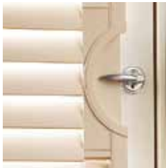
French Door Cut-Out